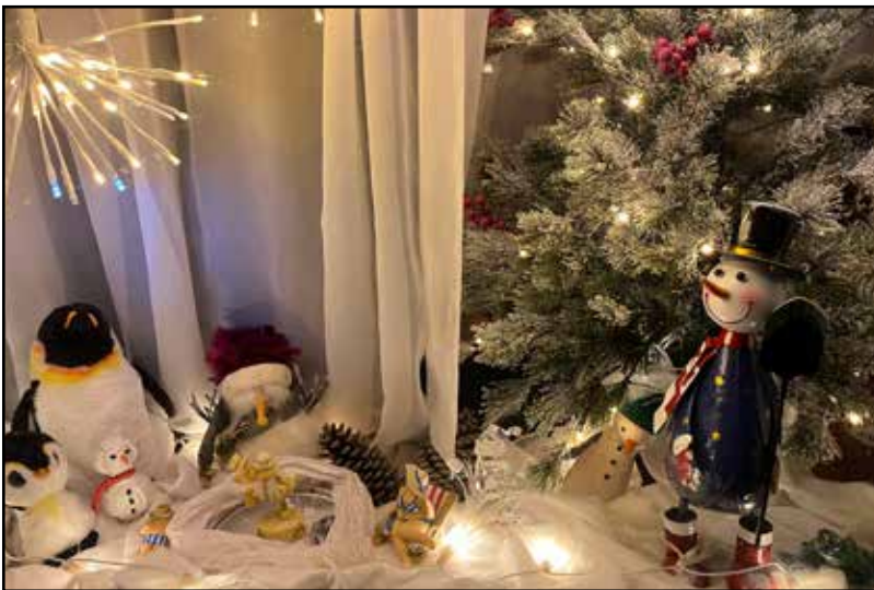
Did you spot the three non-Christmas items?