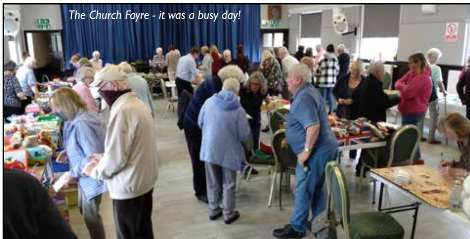
The Church Fayre - it was a busy day!