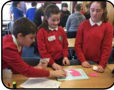
Above - P7 maths event; Below - beer goggles;