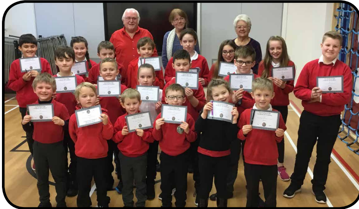
Above - Scots poetry competition; Below - world book day