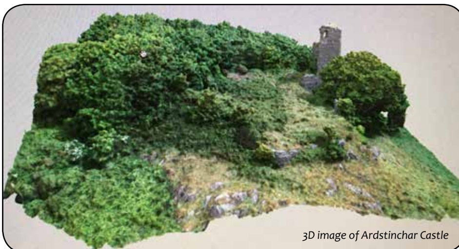
3D image of Ardstinchar Castle

Anyone with information can contact Police Scotland on 101, or Crimestoppers anonymously on 0800 555 111.