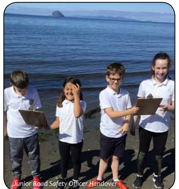
Junior Road Safety Officer Handover