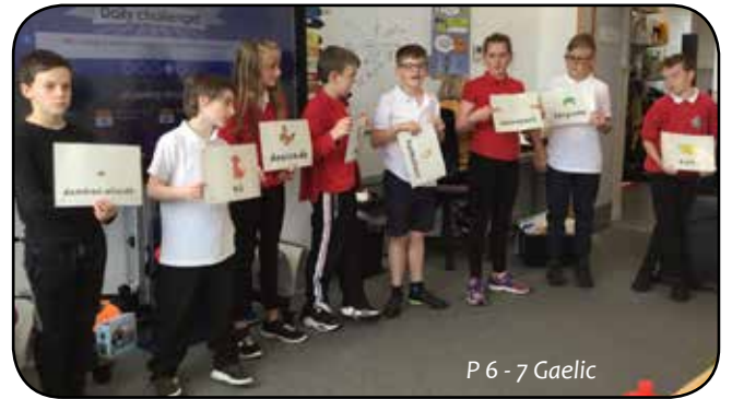
P 6 - 7 Gaelic