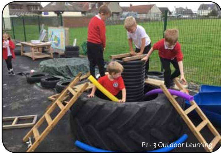
P1 - 3 Outdoor Learning