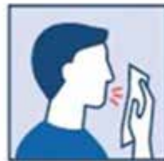
Use a tissue for coughs and sneezes.