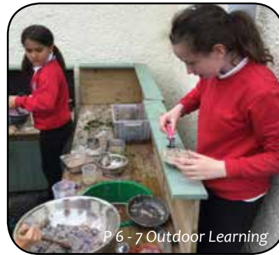
P 6 - 7 Outdoor Learning