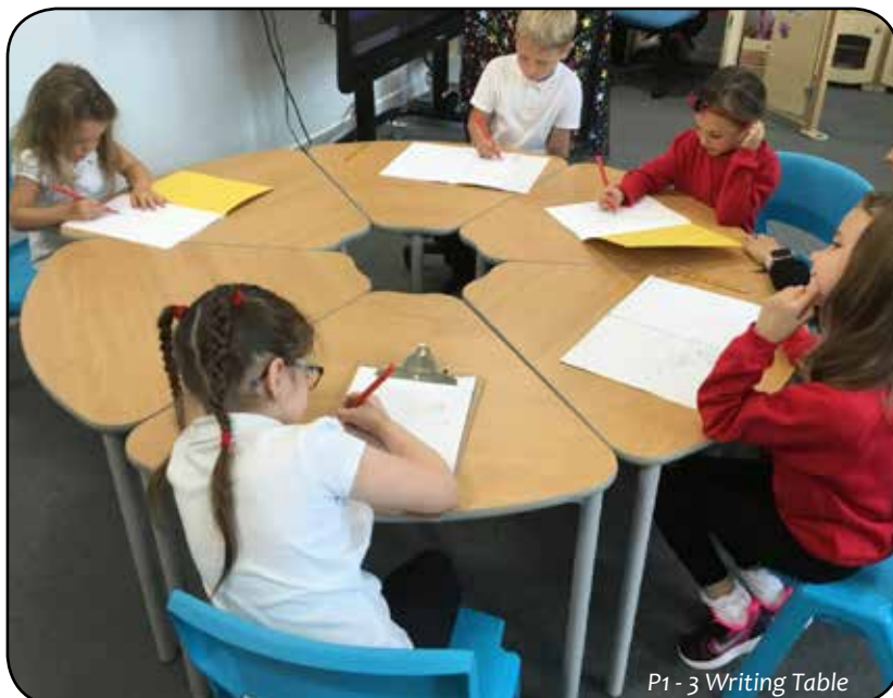
P1 - 3 Writing Table