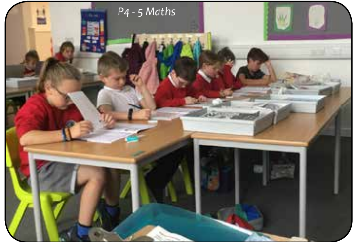
P4 - 5 Maths