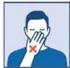
Avoid touching your face.